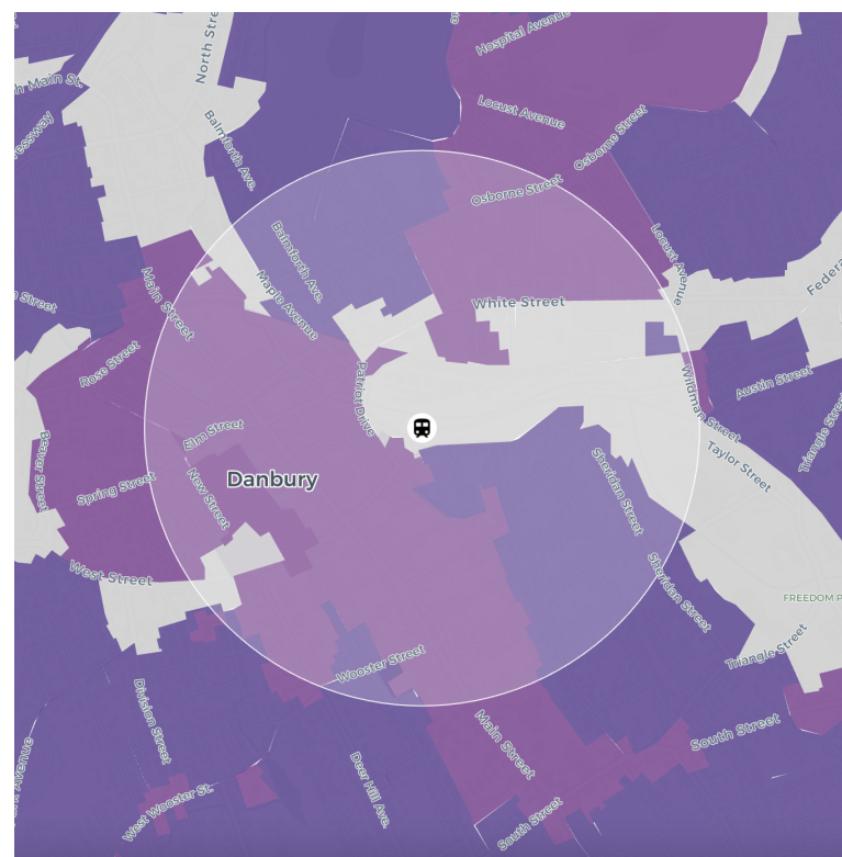
Where Single-Family Housing is Allowed (in purple)

Danbury's current zoning cheats everyone out of the benefits of housing near transit.