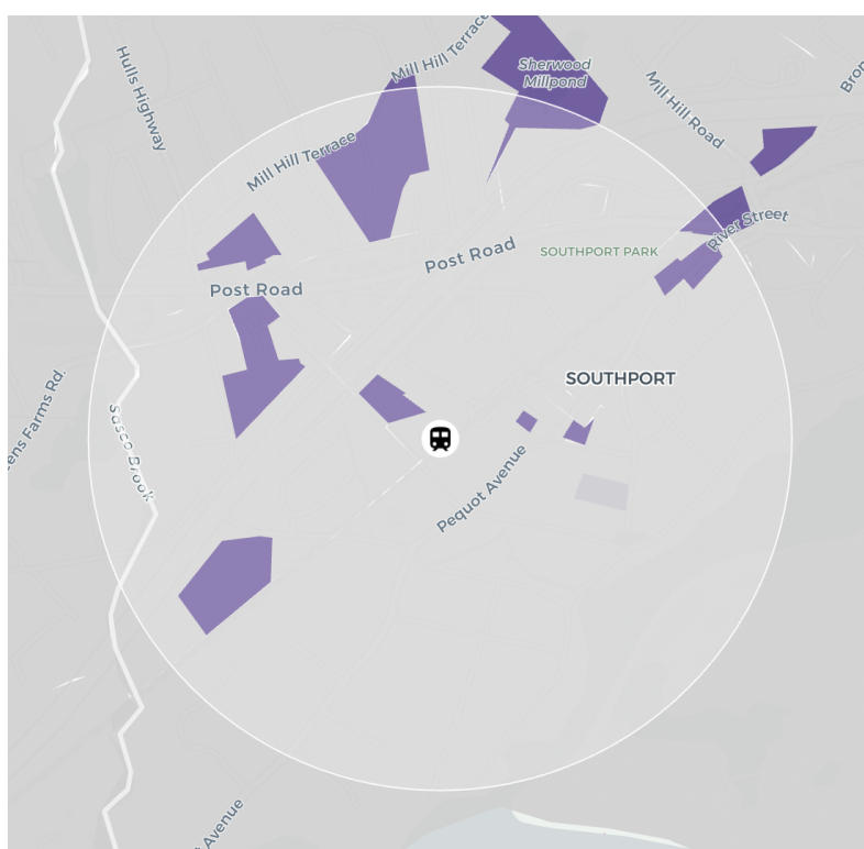
Where 4+ Family Housing Is Allowed (in purple)