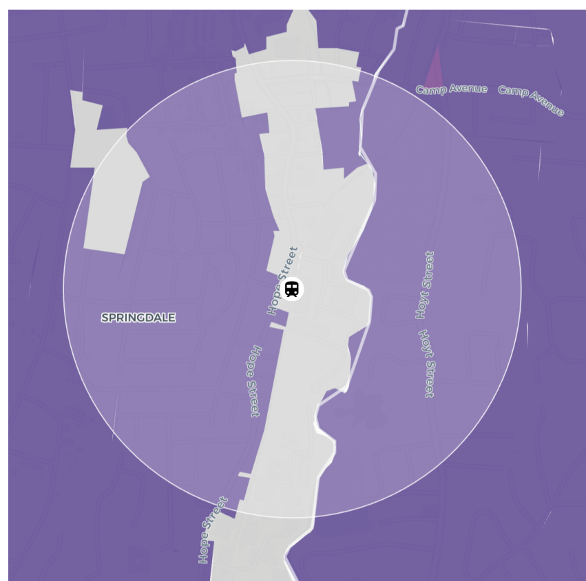
Where Single-Family Housing is Allowed (in purple)

Stamford's current zoning cheats everyone out of the benefits of housing near transit.